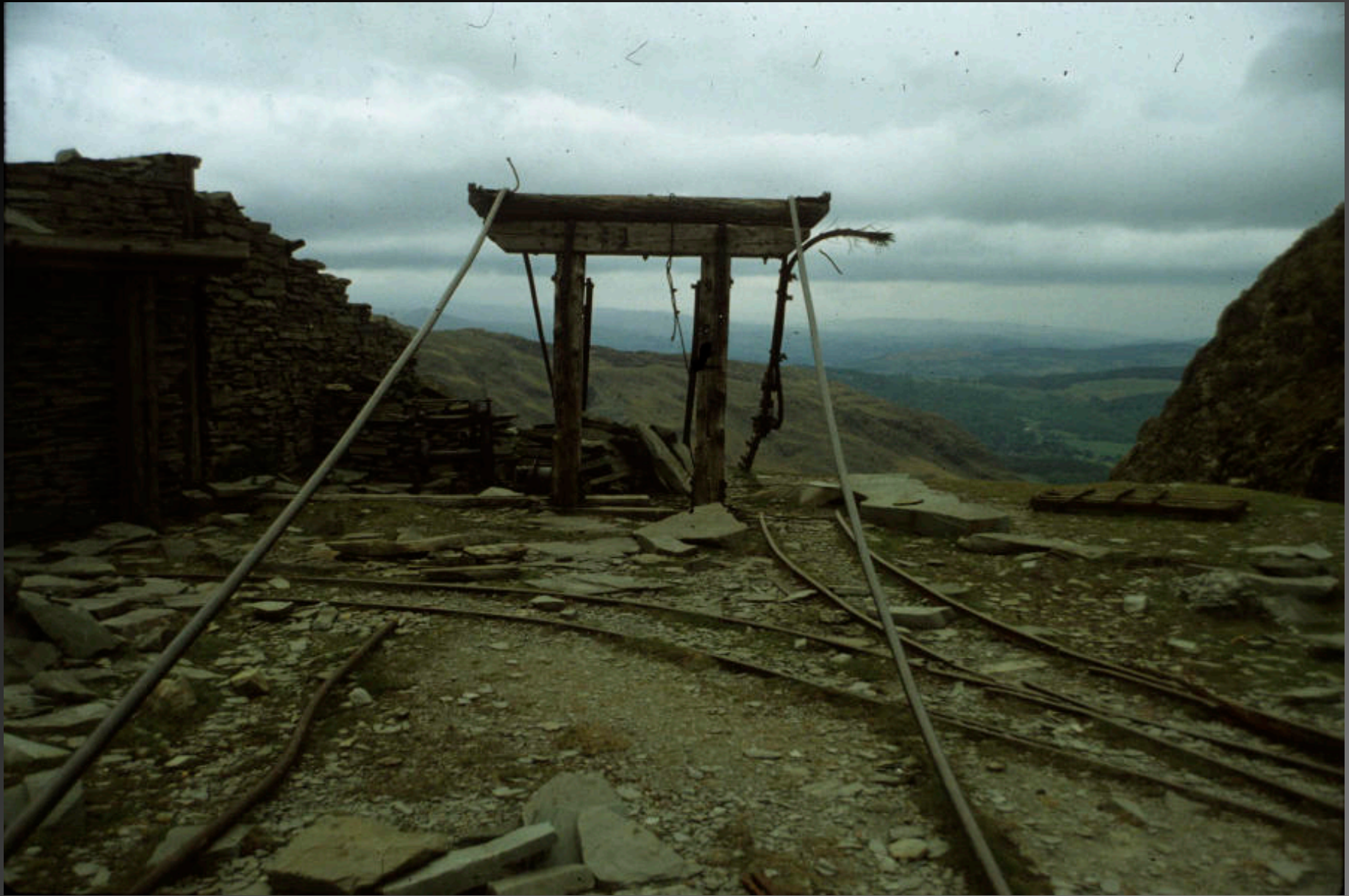
Coniston Slate Quarry