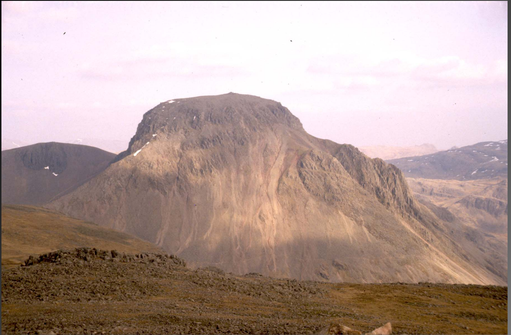
Great Gable [Sty Head]