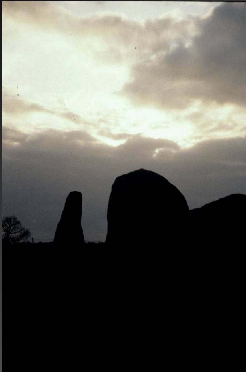
Long Meg & Her Daughters, Penrith