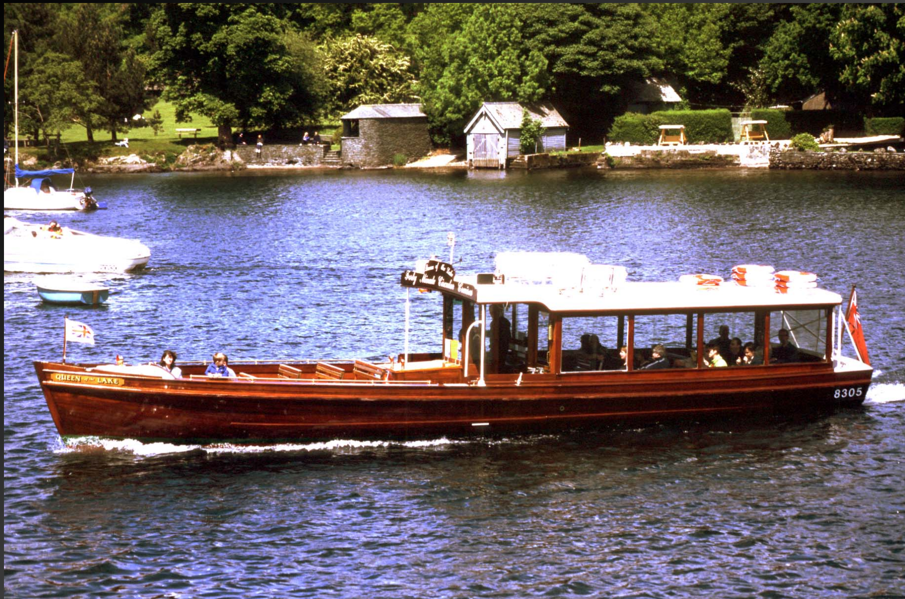
Victorian Steamer, near High Wray Bay, Windremere