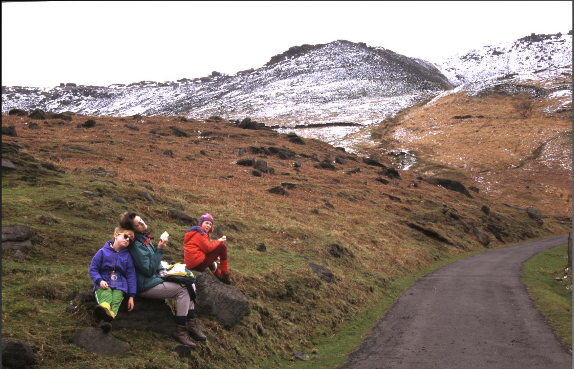
Skelwith, Black Fell