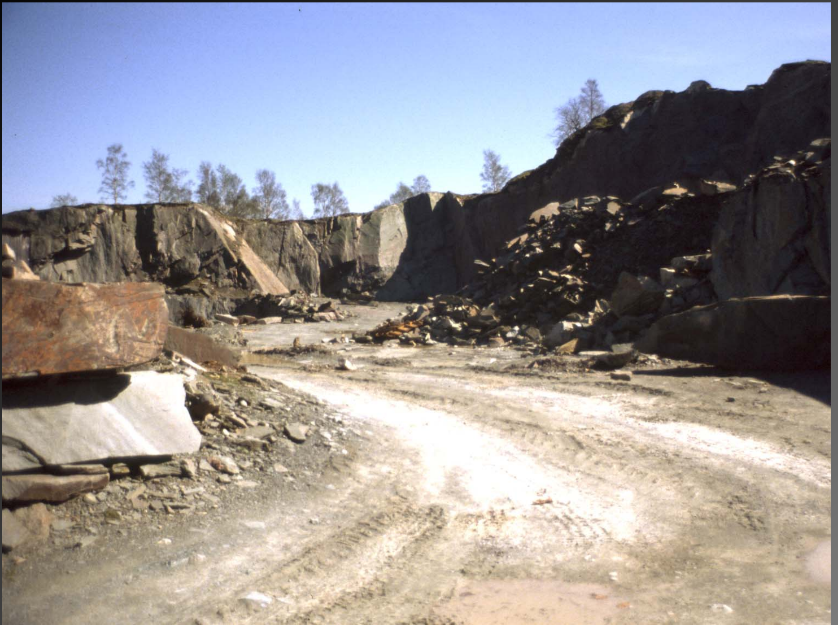
Slate Quarry, near Eltermere