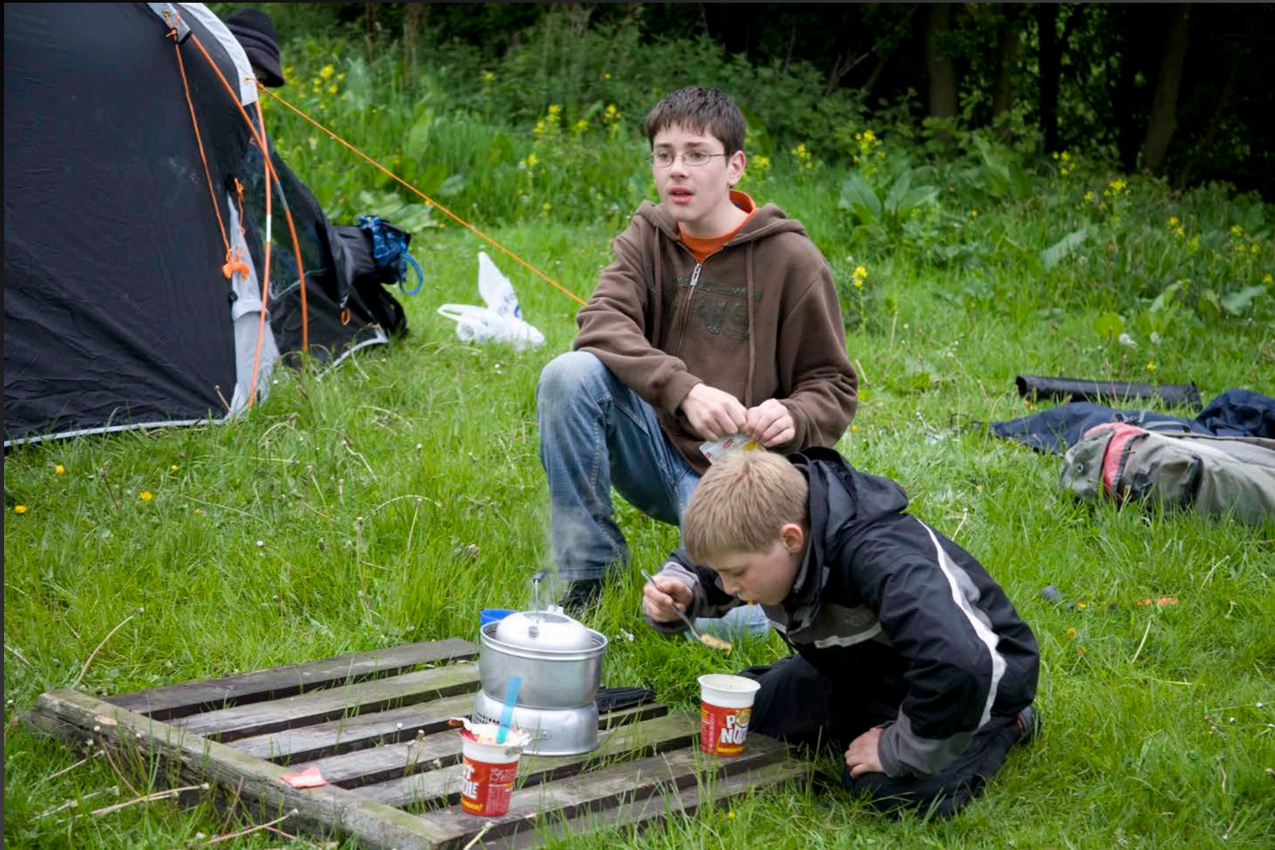
Great Tower Scout Campsite, E Windermere