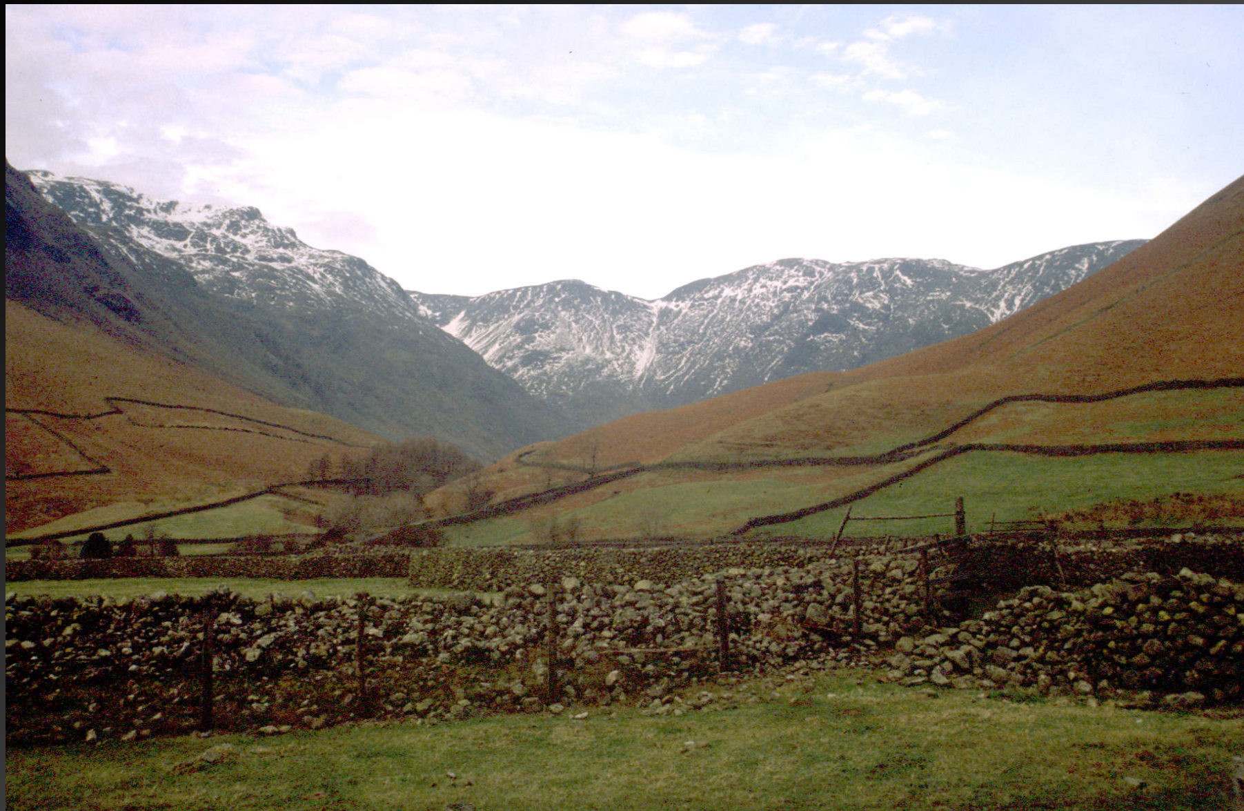
Kirk Fell, Great Gable, Lingmell Crag [Wasdale]