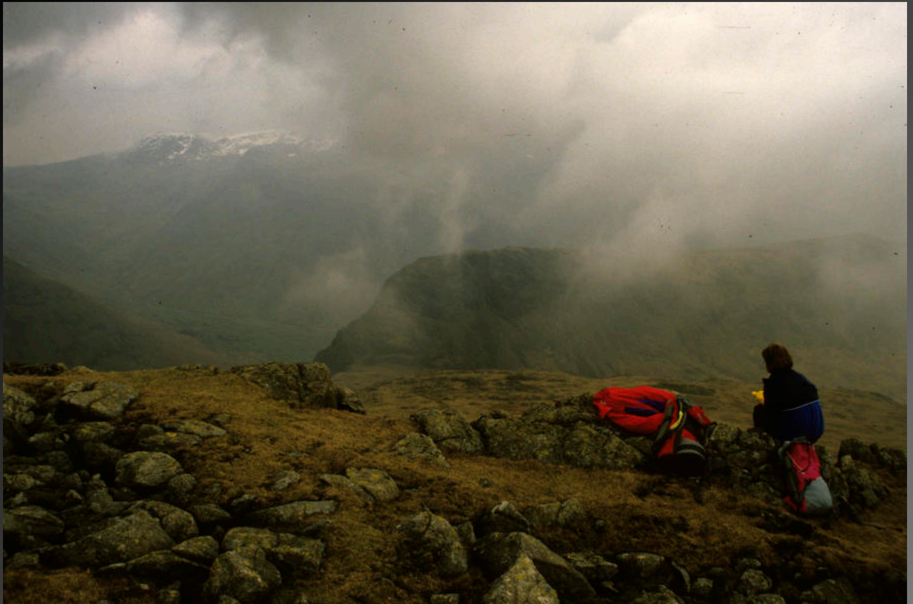
Derwent Water, Skiddaw