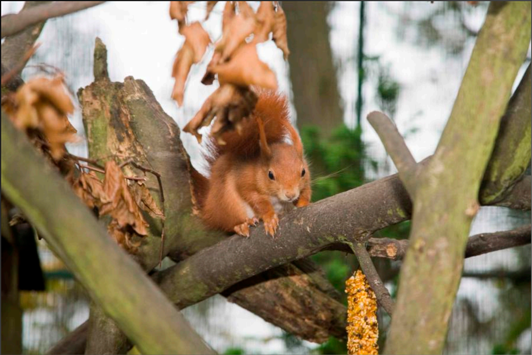
Red Squirrel, Bark House Wood [W Windermere]