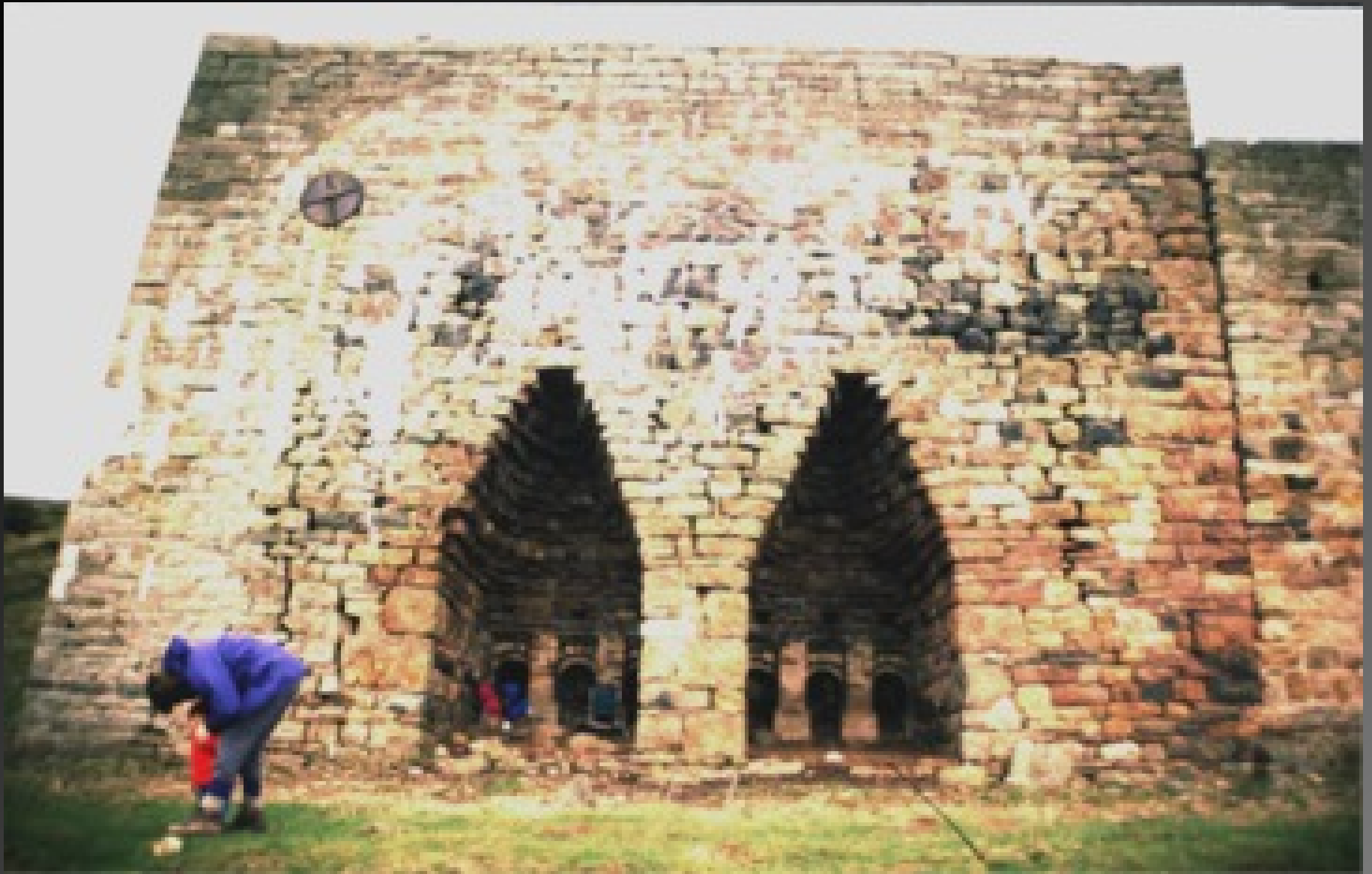
Derwent Water, Skiddaw