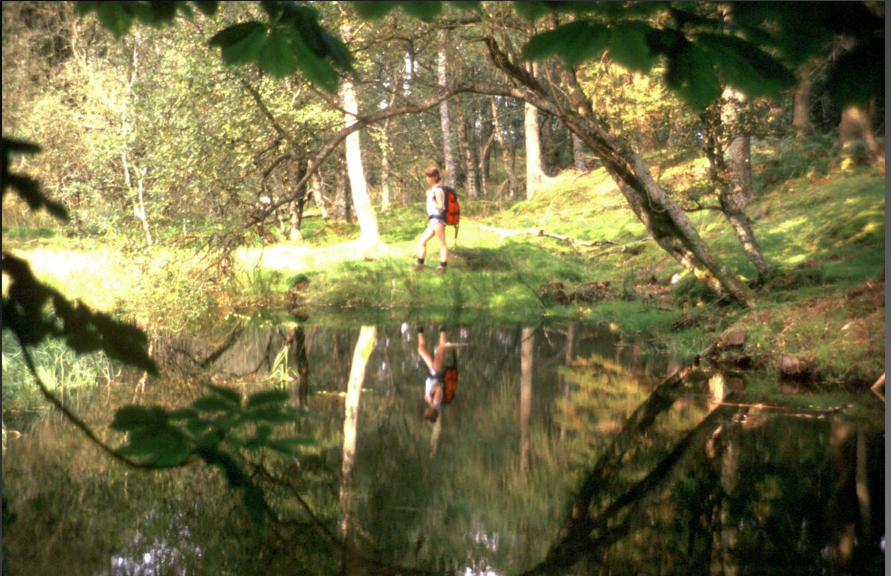
Greenglades, near Braithwaite