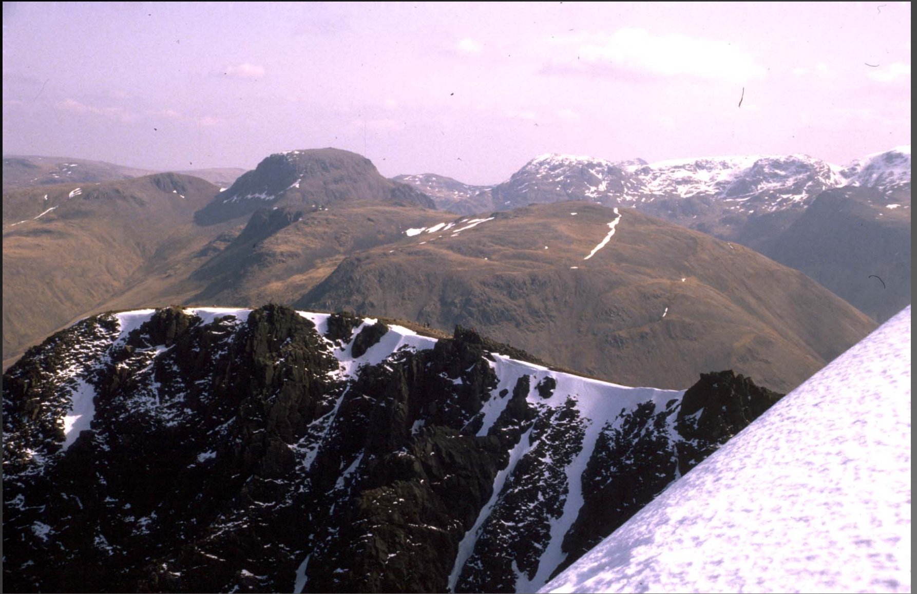
[Helvellyn] Striding Edge