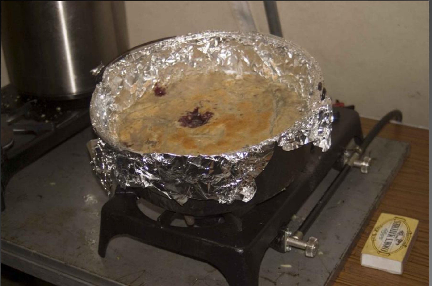
Great Tower Scout Campsite, E Windermere